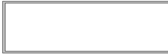
Figure 8 – 2 A Gravitation Deflector Driven Spacecraft

A spacecraft gravitation deflector drive would be a deflector in cup form, mounted on the rear of the spacecraft and extending the spacecraft's full length to the nose, as in Figure 8 - 2 below, with engineered arrangements for varying the amount of deflection.